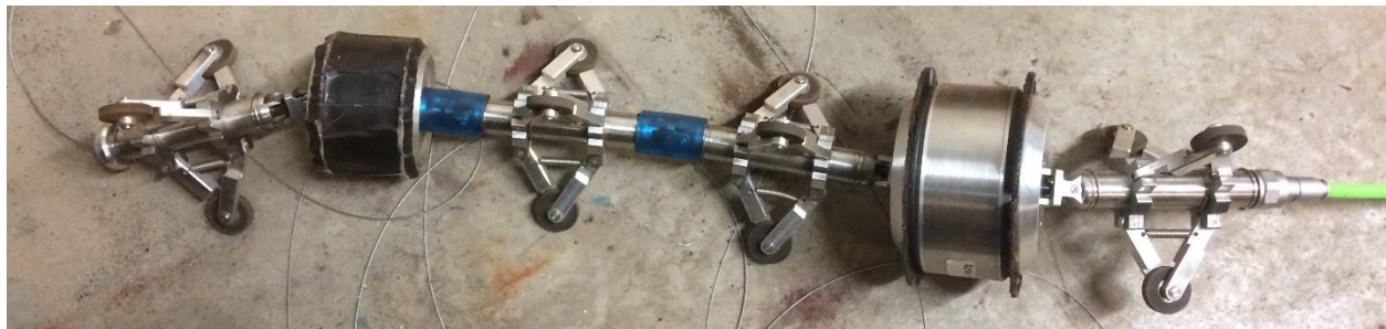
Classical RFT Array Probe (120mm OD)

This technique has the advantage that a certain diameter probe can easily be disconnected and replaced by a different diameter probe without having to modify the rest of the system (eddy current unit, cable, etc.). It is therefore more economical to switch between different probe diameters.