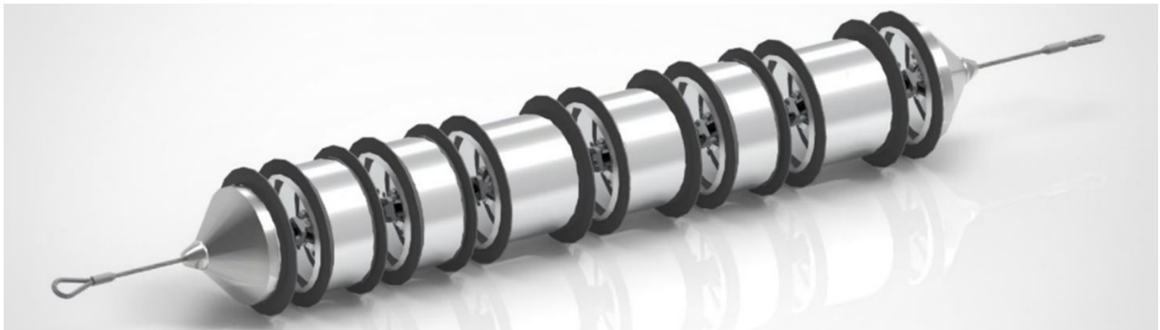
85mm OD Intelligent RFT Array Probe

This technique makes it however more expensive to switch from one probe diameter to another as each probe as its own embedded "intelligent" electronic.