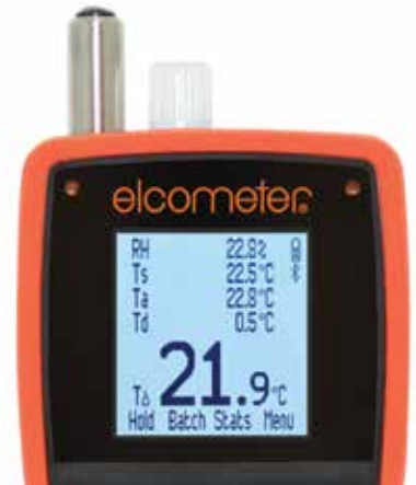
Large easy to read measurements in degrees °C or °F

BS 7079-B4, IMO MSC.215(82), IMO MSC.244(83), ISO 8502-4, US Navy NSI 009-32, US Navy PPI 63101-000