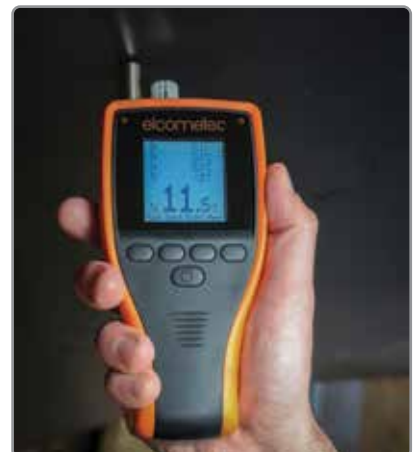
Dustproof and waterproof with fully sealed sensors