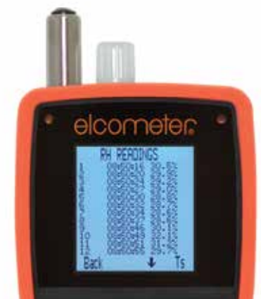
Review individual readings

The Elcometer 319 can be used as either a hand-held dewpoint meter or as a remote data logging monitor. 2