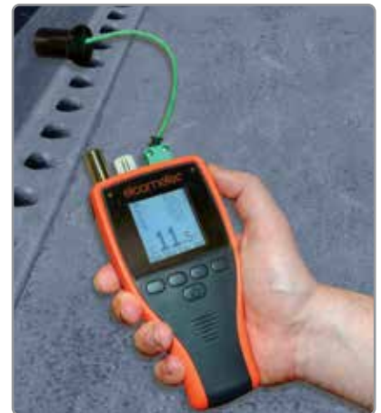
Easy to use with an intuitive menu structure

Connect the Elcometer 319 via Bluetooth® or USB to a PC, Android™ or iOS mobile device & download the data into an inspection application or into ElcoMaster® for instant report generation.