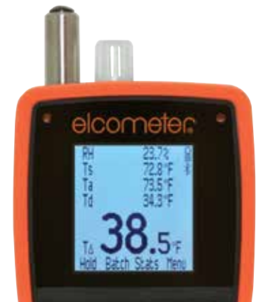
View up to 5 user selectable statistics on screen