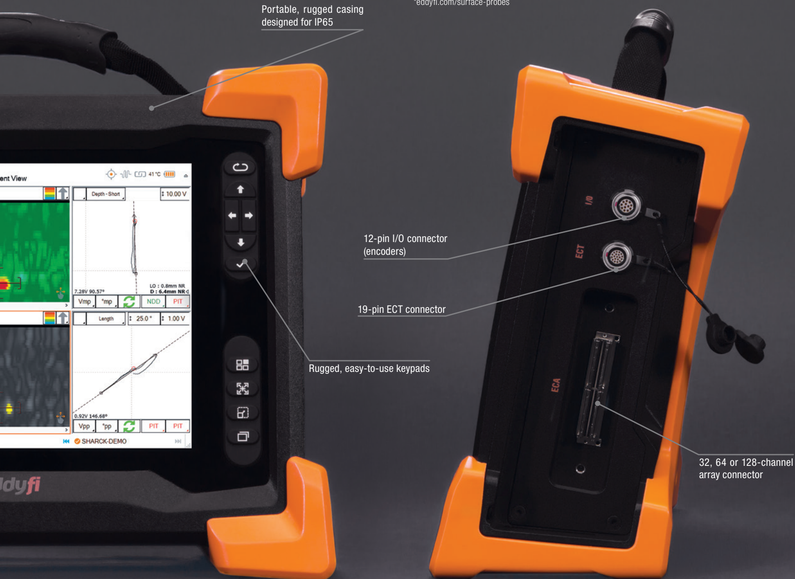
Portable, rugged casing designed for IP65