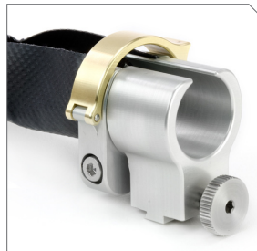
Zipper Tube Cable Mgmt. Kit CES044-04.5