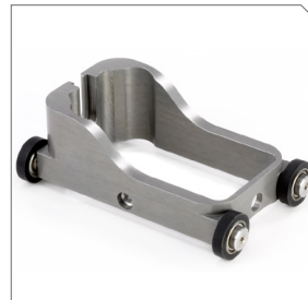
HydroFORM™ Cart PHS044