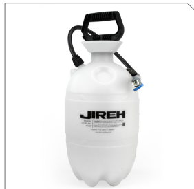
Manual Couplant Pump - 3 gal. CMA014