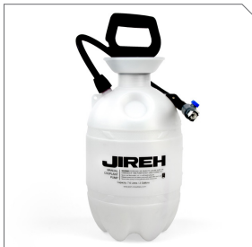
Manual Couplant Pump - 2 gal. CMA013