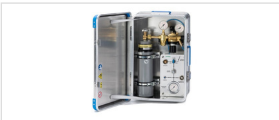
VT Nitrogen Nitrogen purge system for periodic re-pressurisation of the camera body