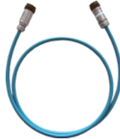
VT 1000 HD CON K