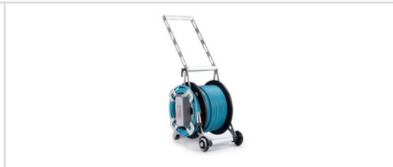
VT 1000 HD SKT Ex Cable reel for VT 1000 Ex system with 50 meters of cable length