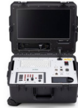
Control unit VT 6360 CU