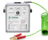
VT 1000 Ex Interface BOX