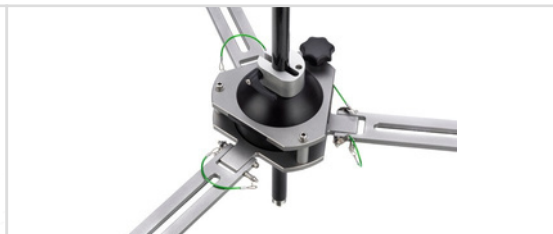
Manhole holders Versatile positionner for 29 mm or 42 mm carbon poles