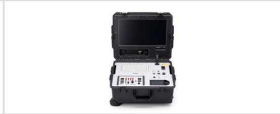
VT 6360 CU Portable CU with integrated 21.5" monitor, text inserter and recording functionality