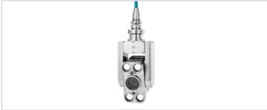
VT 1000 PTZ - LASER HD Ex Full HD camera with 30x optical zoom, pan and tilt function and integrated lighting