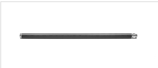
Carbon poles – 29 or 42 mm diameter Carbon poles for deployment of cameras and tools