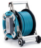
VT 1000 HD SKT Ex