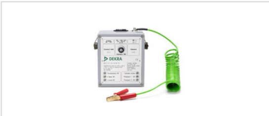
VT 1000 Ex Interface BOX Acts as the mediator between the Ex and non Ex part of the system