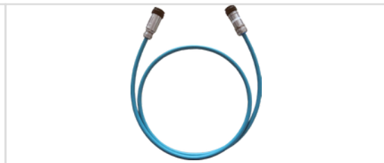
VT 1000 HD CON K Connects the CCU with the VT 1000 Ex Interface BOX