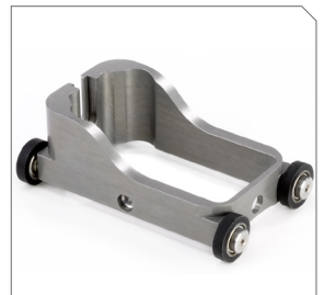
HydroFORM™ Cart PHS044