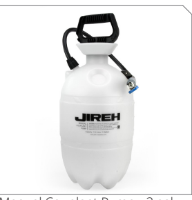
Manual Couplant Pump - 3 gal. CMA014