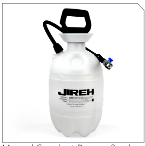
Manual Couplant Pump - 2 gal. CMA013