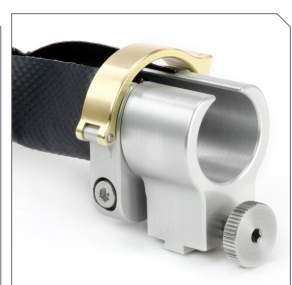
Zipper Tube Cable Mgmt. Kit CES044-04.5