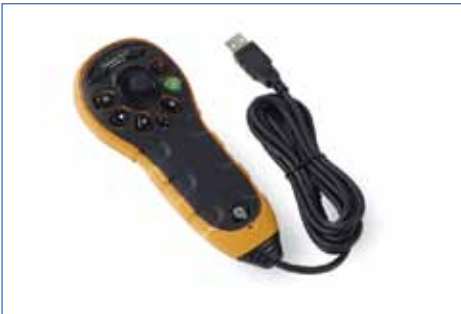
Remote control with joystick