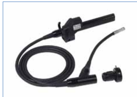
Borescope adapter for rigid and flexible bore- scopes and high- magnification lenses