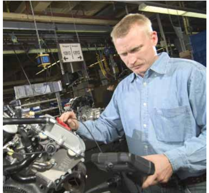
Inspect valve seating through the spark plug port