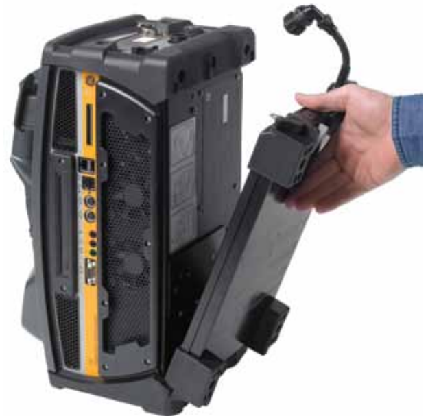
System with integrated battery