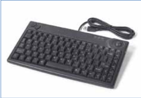
USB® keyboard with trackball