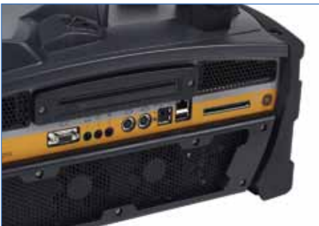
CompactFlash® card slot for external memory