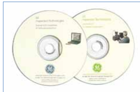
Application software (Menu Directed Inspections and Report Generators)