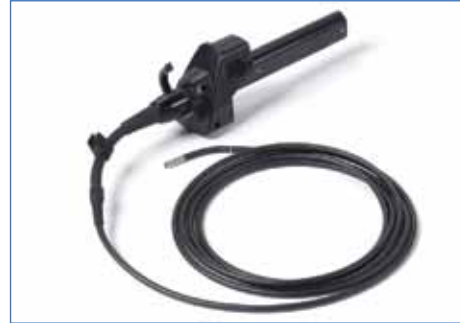
QuickChange™ spare probes in 3.9 mm, 5.0 mm, 6.1 mm, 6.2 mm with working channel and 8.4 mm diameters in lengths of 2, 3, 4.5, 6, 8, and 9.6 meters