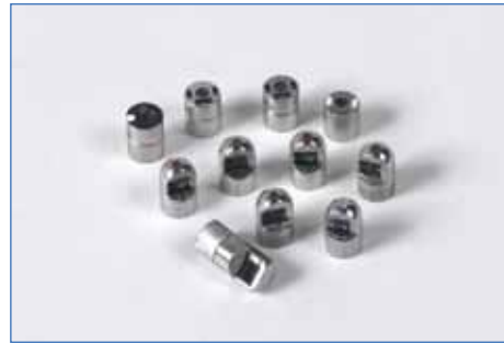
Full range of optical tips including 3D phase, stereo and shadow measurement with a NIST traceable verification block