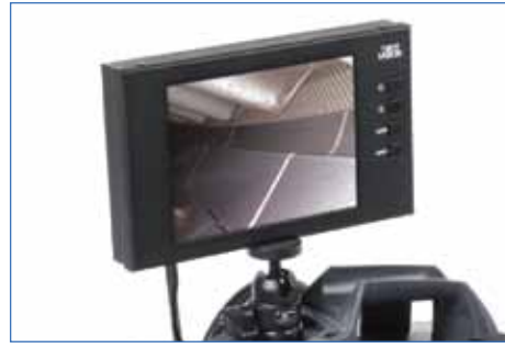
External SVGA LCD monitor