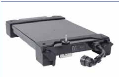
One- or two-hour capacity battery/UPS (uninterruptible power supply)