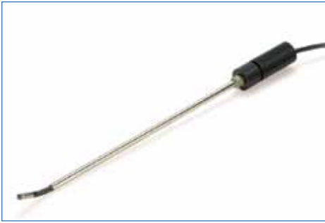
Rigidizers and Grippers