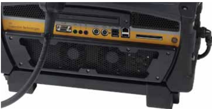
One- or two-hour capacity battery/UPS facilitates confined space work.