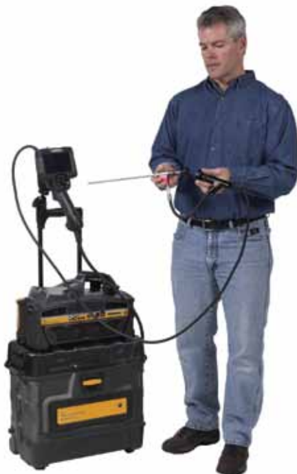
Borescope adapter to integrate user's current rigid and flexible borescope.

The 3D Phase Measurement increases efficiency in aerospace and rotating equipment applications. This 3D technology provides an accurate 3 dimensional surface scan allowing measurement of all aspects of surface indications. Using a single probe tip, inspectors can both view and measure a defect, saving time and increasing overall inspection productivity. This eliminates the extra steps required to back out, change the tip and then relocate the defect. In effect, 3D Phase Measurement provides accurate measurement "on-demand" while simplifying the inspection process.